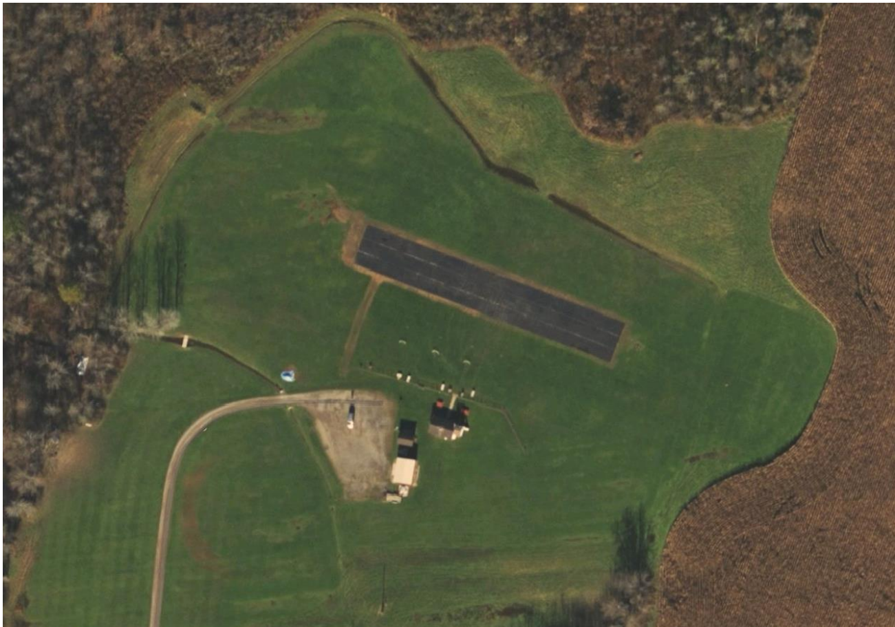
The latest satellite photo with the new runway! Just need the control line circle improvements. Thanks Gary Natali

Remember: A repaired aircraft should be treated just like a new aircraft. It needs a full ground check before flying. Don't forget to inspect the areas that were not repaired. They may have hidden damage. Fly it like it's the first time in the air and will need a full functional check before flying it in front of spectators or in competition.